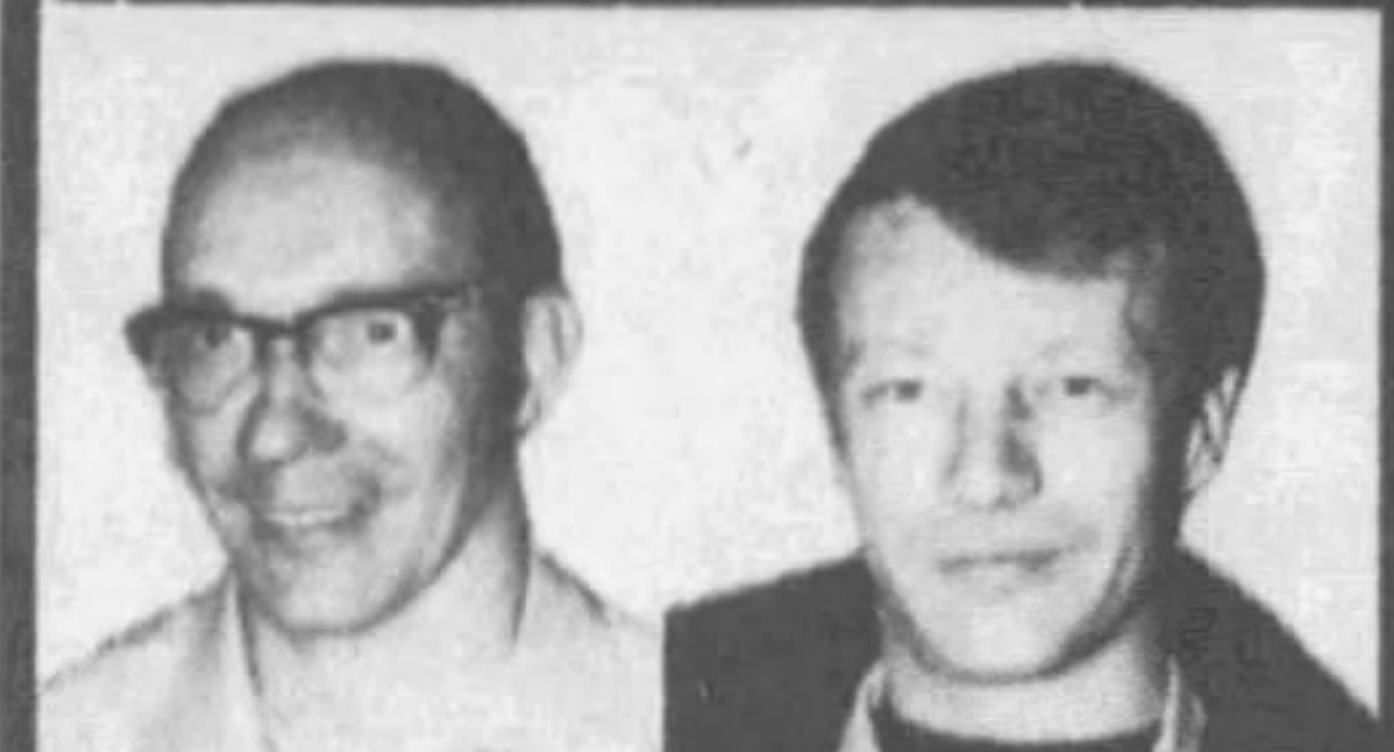
by TOM SCHEMMER & JOHN FORSYTHE

Keep the leading edges of your hood and fenders from really taking a beating by giving them a good undercoating of wax often. Grit, especially at higher speeds, can be very destructive. Watch for tiny paint chips in this area. Paste wax can be a very effective protection for this. And remember, don't follow too close behind sand and gravel trucks on highways. Sand blowing back onto your car can cause a great deal of damage to the paint job, as well as to your windshield.